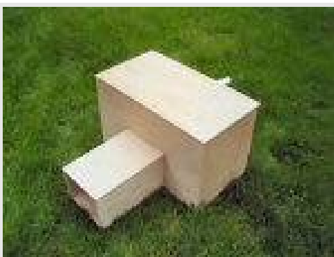
Hedgehog box purchased from the RSPB.